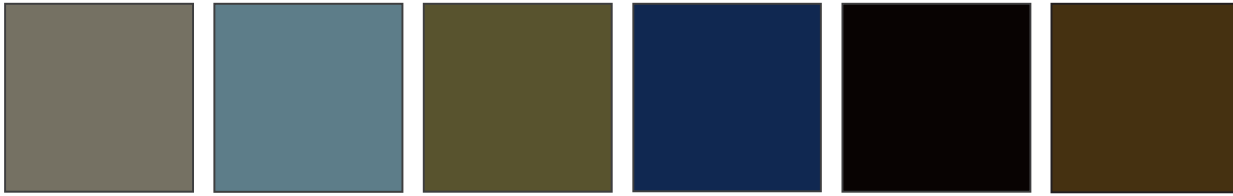
sable wedgewood blue backwood old world blue plum black bronze