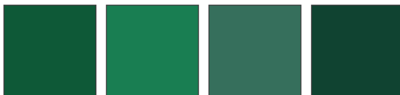
amazon green leaf green ivy green forest green

note: colours may appear different from actual sample